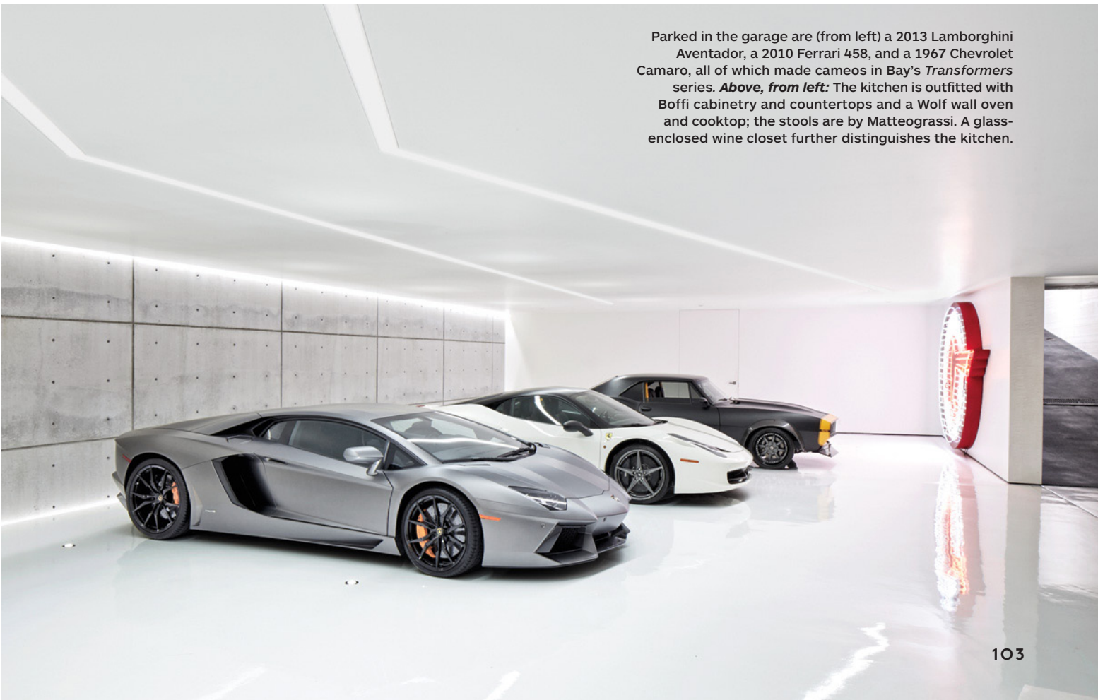
Parked in the garage are (from left) a 2013 Lamborghini Aventador, a 2010 Ferrari 458, and a 1967 Chevrolet Camaro, all of which made cameos in Bay's Transformers Camaro series. Above, from left: The kitchen is outfitted with Boffi cabinetry and countertops and a Wolf wall oven and cooktop; the stools are by Matteograssi. A glass-enclosed wine closet further distinguishes the kitchen.